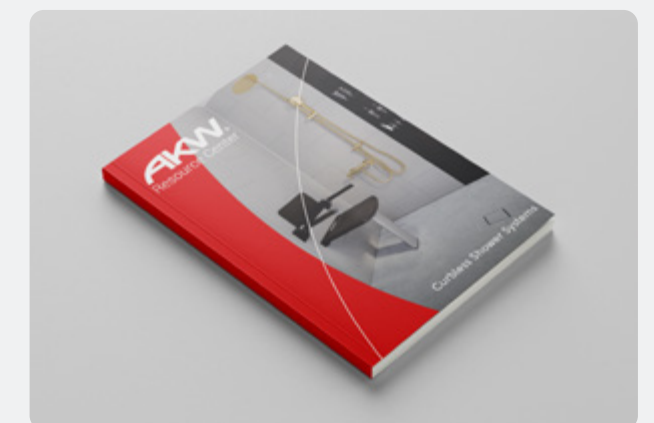
Curbless Shower Systems Brochure