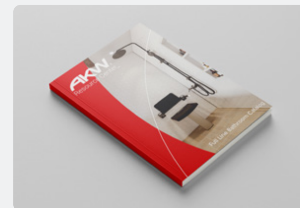
Full Line Bathroom Catalog