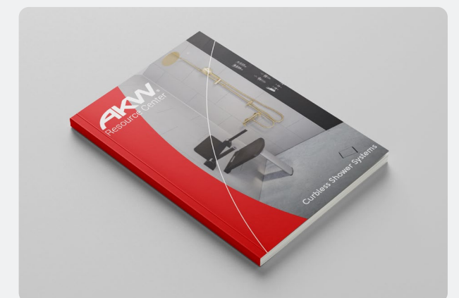
Curbless Shower Systems Brochure