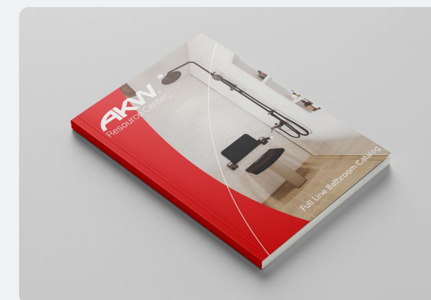
Full Line Bathroom Catalog