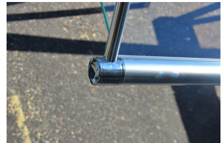
Add decorative cap onto tie bar receptor.