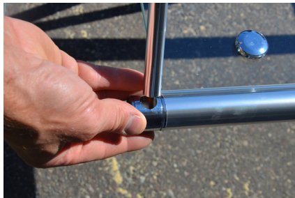
Install tie bar receptor and tie bar.