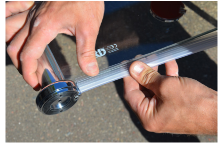
Slide seal onto glass if desired.