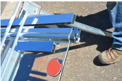
Install floor spacer for "fixed" edge.