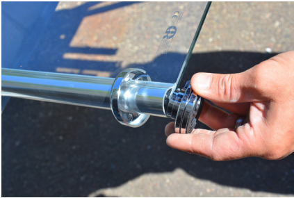
Install foot spacer(s) onto post.