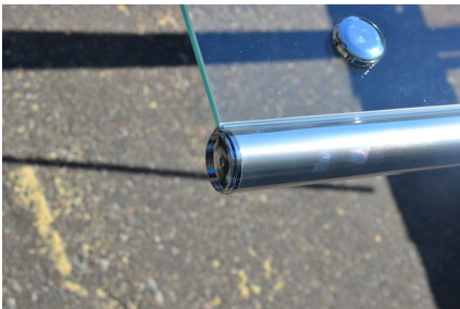
Install base for tie bar receptor.