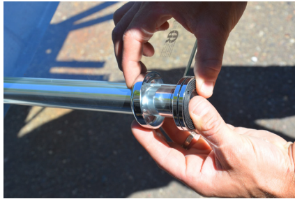
Slide cover over foot spacer(s).