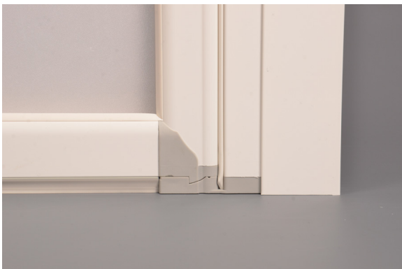
A riser mechanism raises each door pair slightly off the floor as it swings open, either inward or outward.