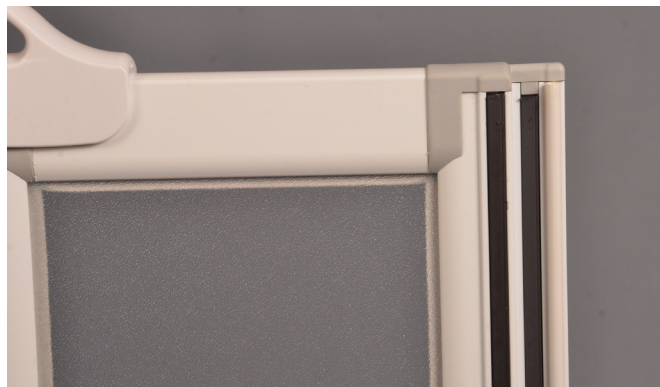
The "free edge" of each door pair has two magnetic strips that seal the overlap connection when the door is closed.