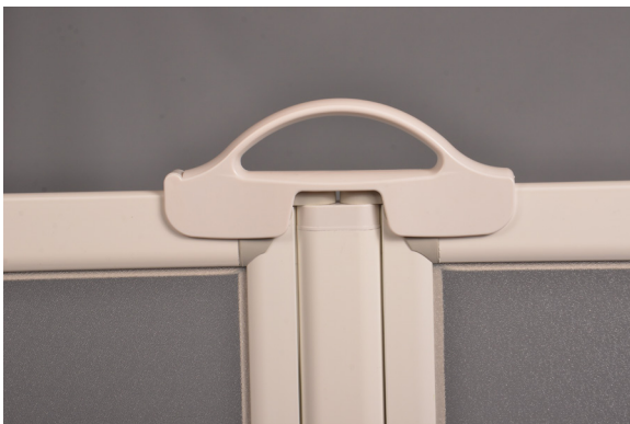
A hinged handle spans each hinge joint to hold the caregiver door straight while in the closed position.