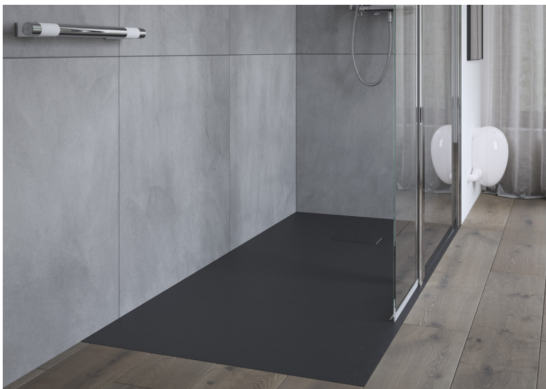
FastDEK installed on finished floor.