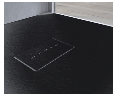
Drain cover detail.