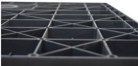
Ribbed underside detail.